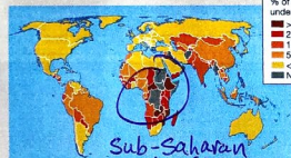
Figure 1 Global undernourishment