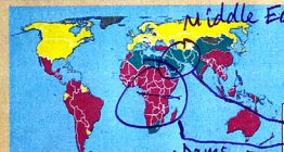
Figure 2 Projected areas of water scarcity by 2025